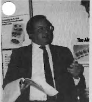
Thre were wonderful exhibitors!