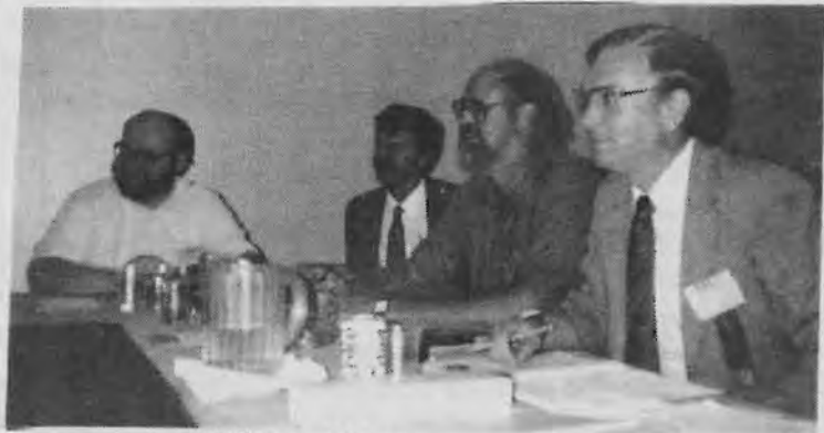
... our 1987 affires...