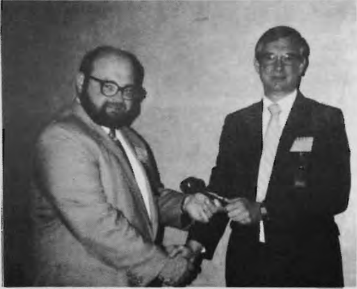
The traditional passing the SOFT product's gover. ... Joaking forward to Philadelphia.