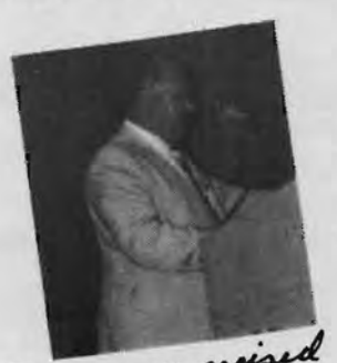
B. was praised for a jud well done ...