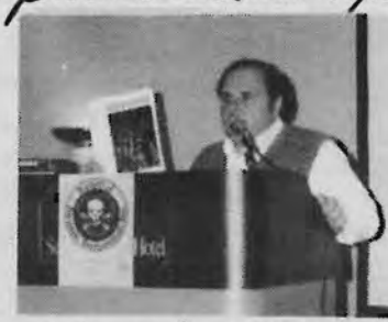
Stip the 1987 SOFT operial issue of JAT ...